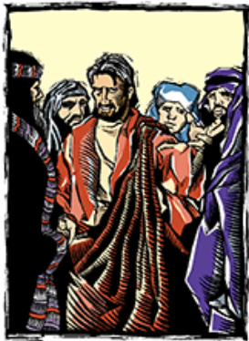
The people gathered around Aaron, and said to him, “Come, make gods for us, who shall go before us.” Exodus 32:1, NRSV

When we read the Bible, we see God, is named with a proper noun. God is THE God, the only God. Our God. We are not to worship anyone other than God.