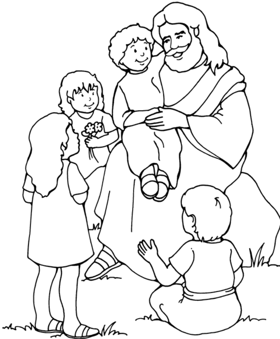
Jesus and the Children

From Thru-the-Bible Coloring Pages for Ages 4-8. © 1986, 1988 Standard Publishing. Used by permission. Reproducible Coloring Books may be purchased from Standard Publishing, www.standardpub.com , 1-800-543-1301.