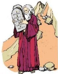
10 Moses delivers the Commandments

In the Old Testament book of Deuteronomy, Moses gave long speeches that told the Israelites all the important things they needed to know before they finally moved into Canaan, the Promised Land.