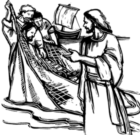
Jesus called out to them, "Come, follow me, and I will show you how to fish for people!" Matthew 4:19 (NLT)