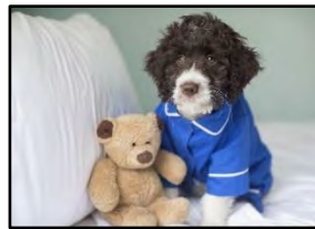
Our Stuffed Animal