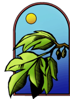
A man had a fig tree planted in his vineyard; and he came looking for fruit on it ... LUKE 13:6, NRSV