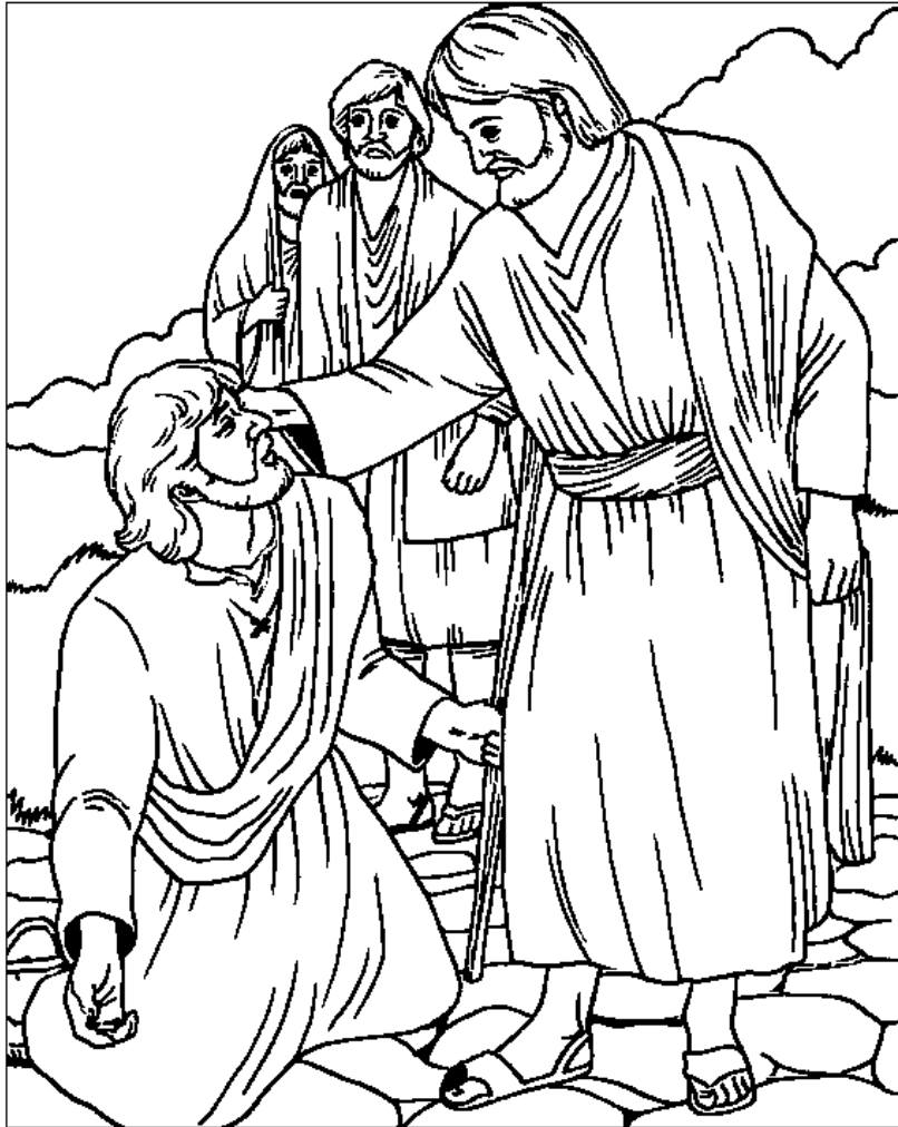
Jesus Heals a Blind Man Mark 10:46-51

From BibleStoryCard Learning System™ Coloring Book © 1996 Wesleyan Publishing House http://www.parable.com/wph/group_1052.htm