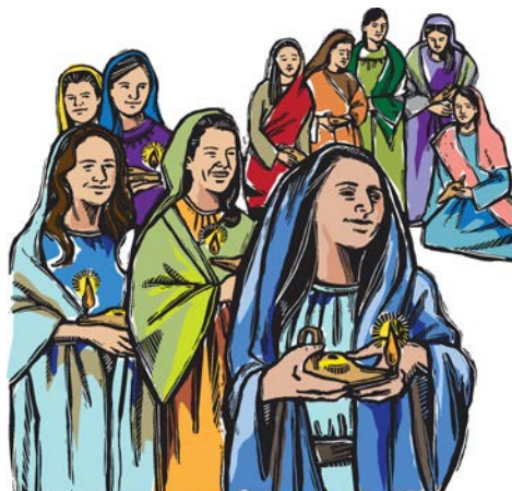
The Parable of the Ten Bridesmaids

I wonder why Jesus told this story about being ready no matter what.